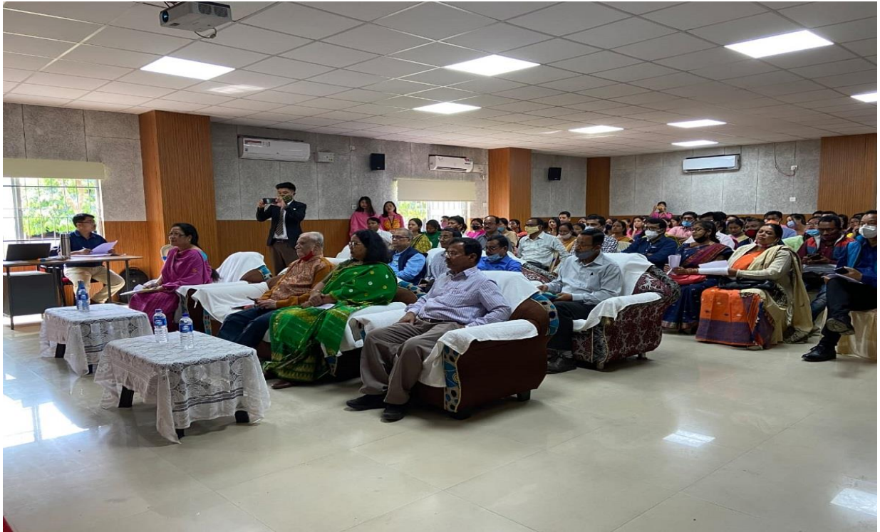
Faculty Development Workshop related to NAAC