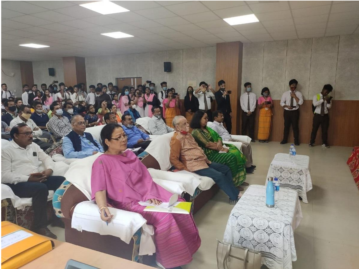
Faculty Development Workshop related to NAAC