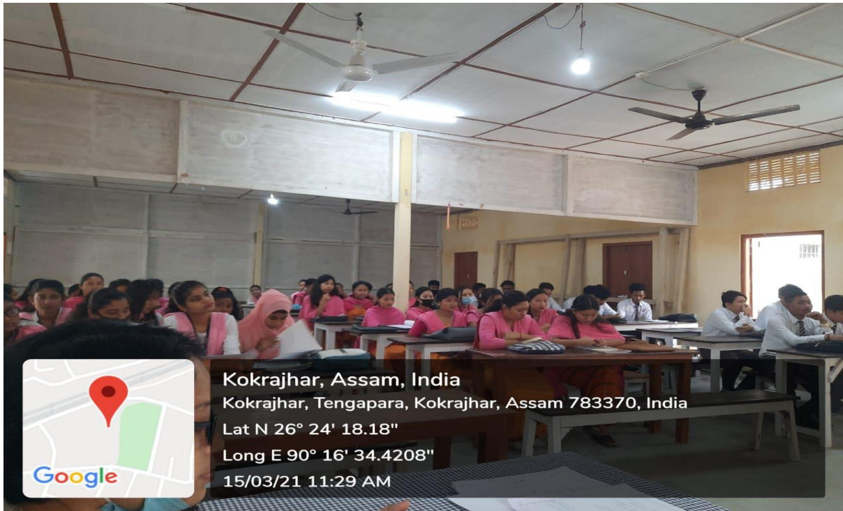
Some glimpses of Departmental Seminar of B.A. 1 st Sem. (Honours) Organized by Department of Education, Kokrajhar Govt. College on 15 th & 16 th of March, 2021 at psychological laboratory of Education Department