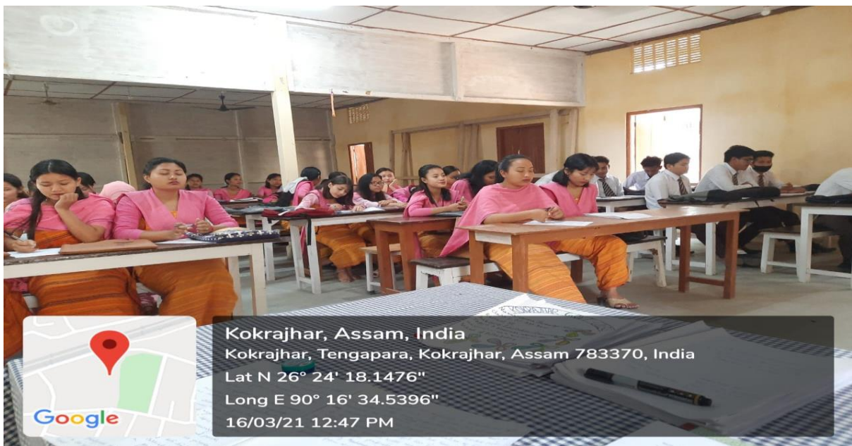
Some glimpses of Departmental Seminar of B.A. 1 st Sem. (Honours) Organized by Department of Education, Kokrajhar Govt. College on 15 th & 16 th of March, 2021 at psychological laboratory of Education Department