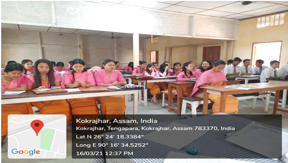
Some glimpses of Departmental Seminar of B.A. 1 st Sem. (Honours) Organized by Department of Education, Kokrajhar Govt. College on 15 th & 16 th of March, 2021 at psychological laboratory of Education Department